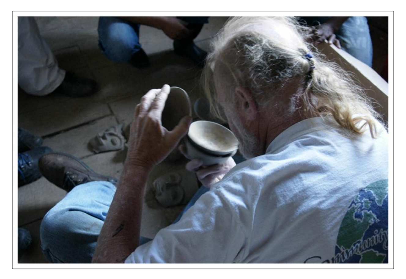
The Initial Examination