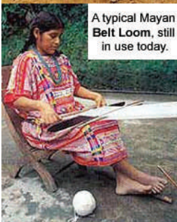
A typical Mayan Belt Loom, still in use today.