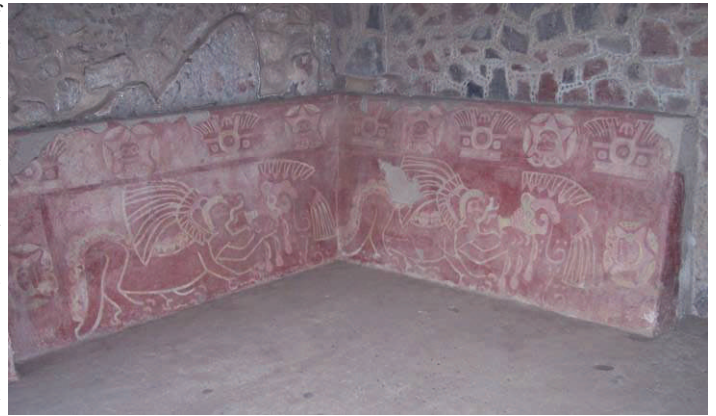
One of the many murals found at Teotihuacán. Will the tunnel beneath the Temple of Quetzalcoatl hold the key to understanding the context of these murals?

The single greatest fear is the potential of repeating the past; overlooking the precious and losing integral understandings of an ancient culture, and because it comes in an unexpected format the great