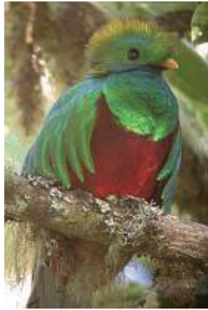
The Quetzal bird was sacred to the ancient Maya.

How do you like my new hat? A hat like this would have been worn by a Leader or king. These green tail feathers come from the Quetzal bird can be 24 inches long.