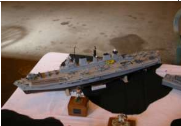
A very nice model of HMS Illustrious