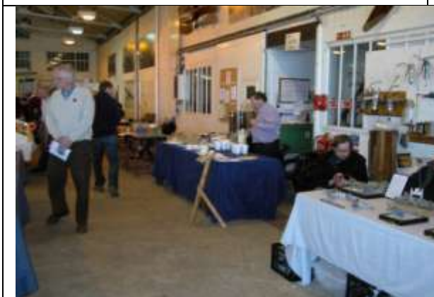
The all Important Tea Table