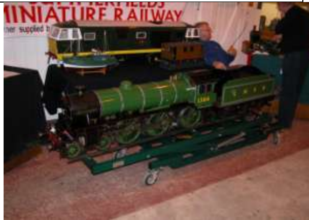
A very large steam engine