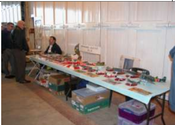
A Display of Japanese Aviation