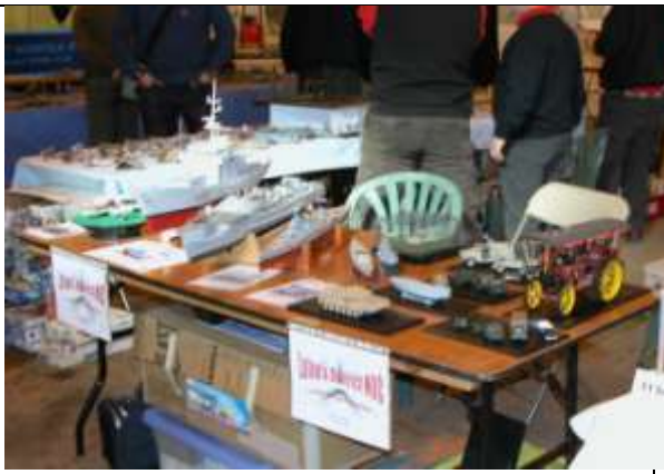
L&DMBC Display Table