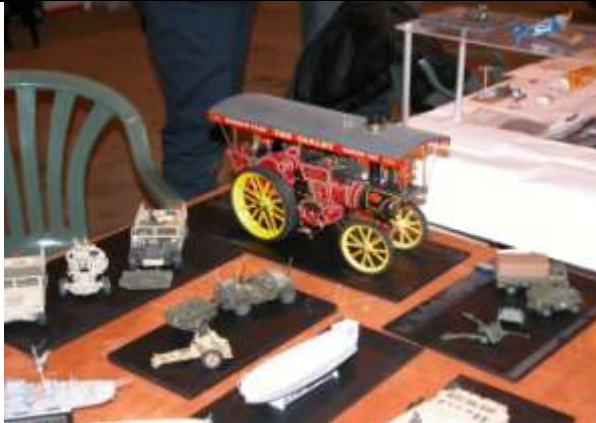
L&DMBC Display Table