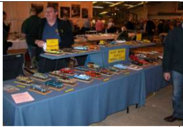
A Display of Model Cars