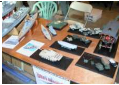
L&DMBC Display Table