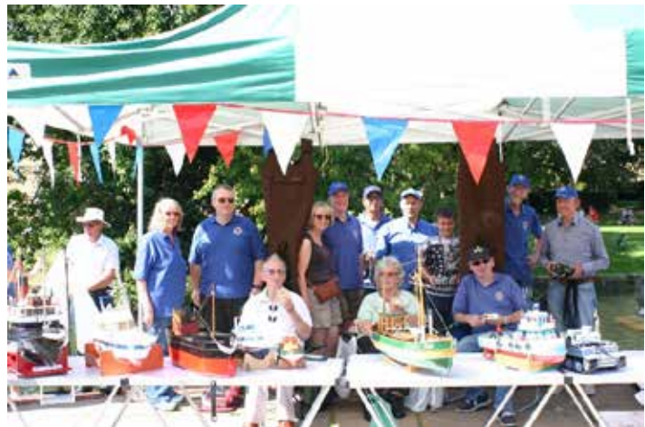
A Picture of most of the CREW at Hitchin on Sea day