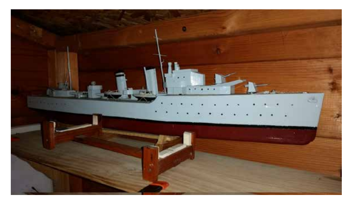
Boat 4 Balsa Wood Construction