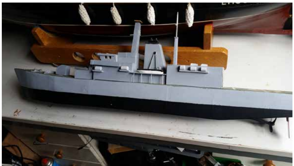
Boat 1 Balsa Wood Construction

The following boats Numbered 1 to 4 are being offered for sale by Pete Carmen at £15 to £25 each, price being dependent on what is inside the hulls eg Motors, Servo's Etc. no other electronics. Contact Peter for details.