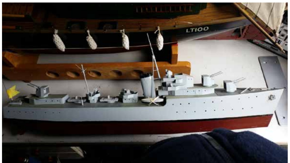
Boat 2 Balsa Wood Construction