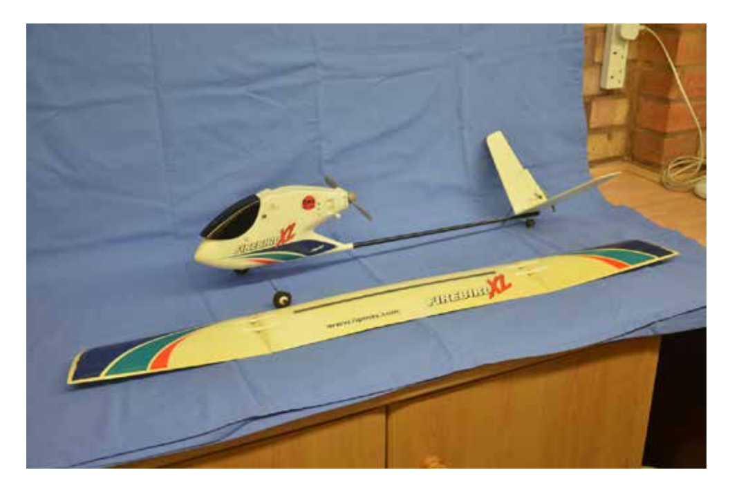
Firebird XL RTF airplane complete with transmitter & charger etc. Asking price £10