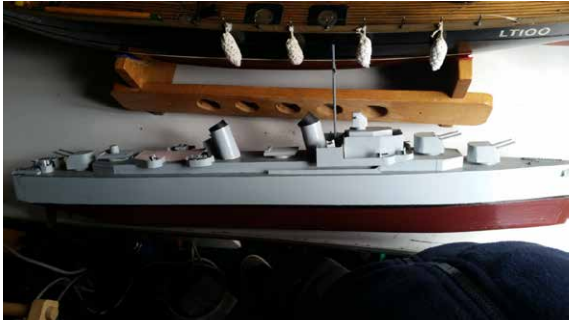
Boat 3 Balsa Wood Construction