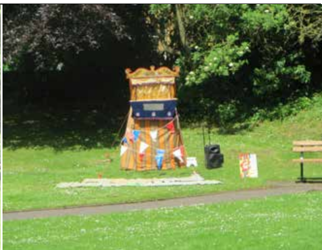
Punch and Judy awaiting its audience