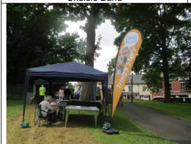
Tring Museum Display