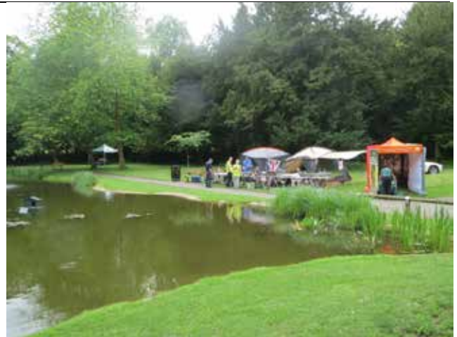
L&DMBC & Woodland Trust Displays