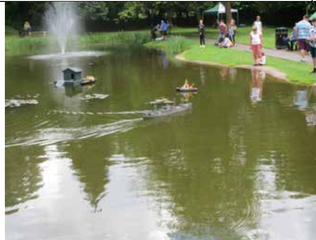
Boats on the water