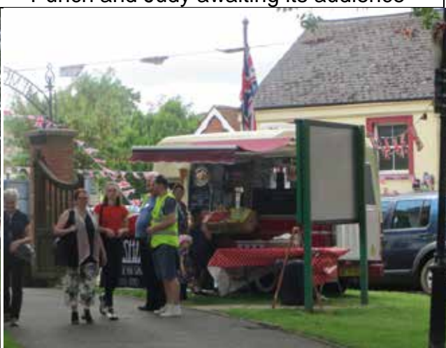
Ice Cream Van at the Entrance