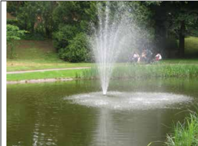
The Lake Fountain