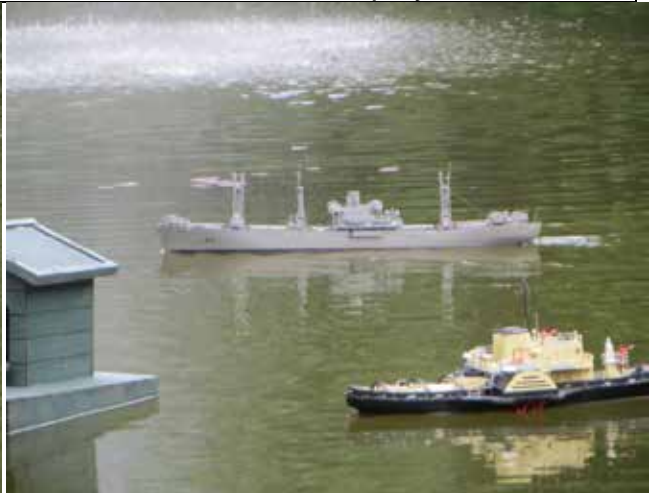
Boats on the water