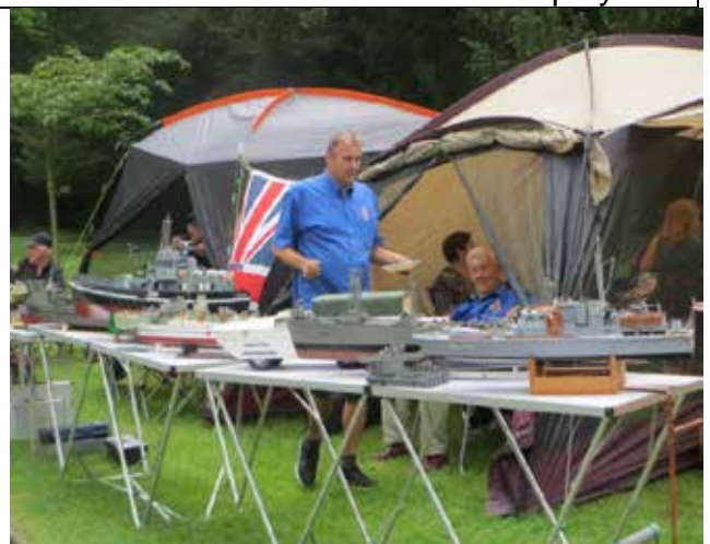
Boats on display