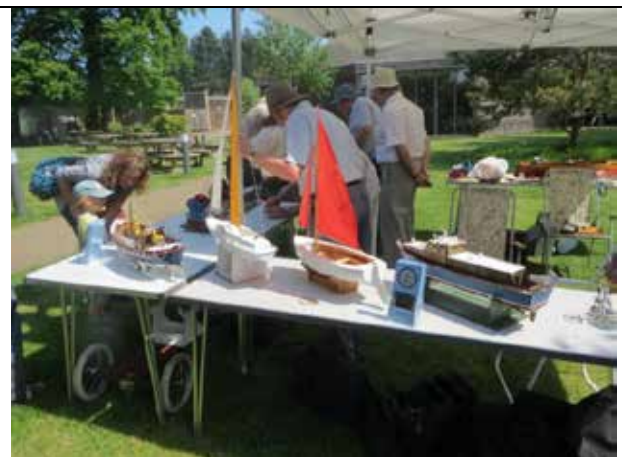
Photo 4 St Albans MES Club Stand