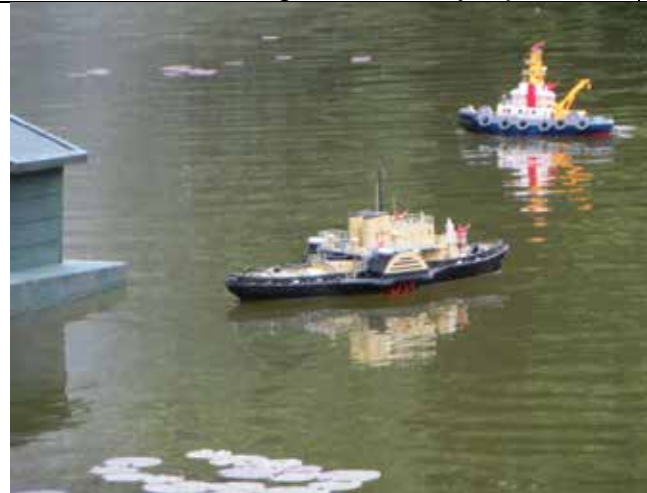
Boats on the water