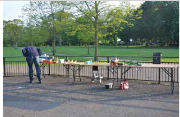
Mike - doing some close inspection?