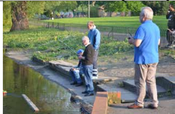
Members in deep concentration sailing their boats, pity I did not include the boats in the photo shot