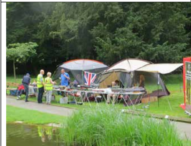
L&DMBC Display Set-up