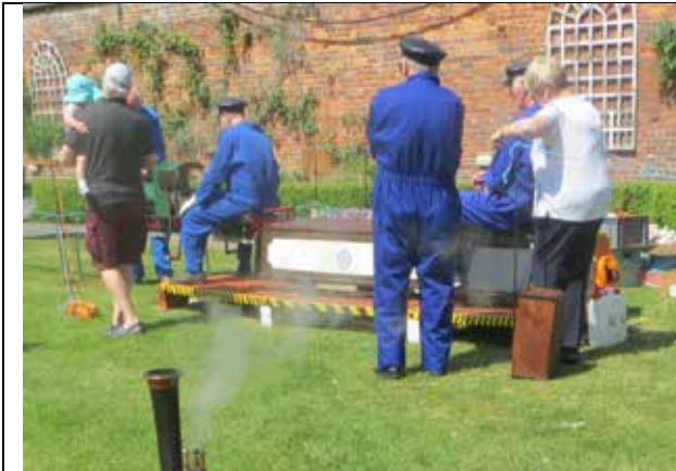
Photo 5 St Albans MES Railway