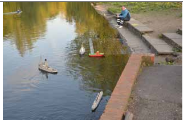
Some Tugs and RMS Britannic