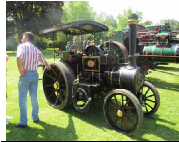
Photo 11 This One's is 1/6 scale