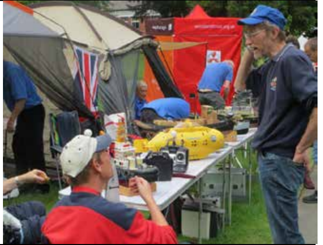
Boats on display