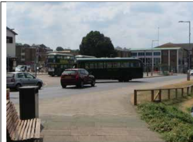
Photo 1 Bus Station and the Old Buses