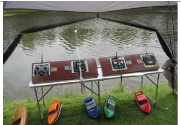
Transmitter Stand with Matching Boats