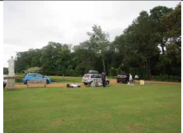
Cars Being Unloaded