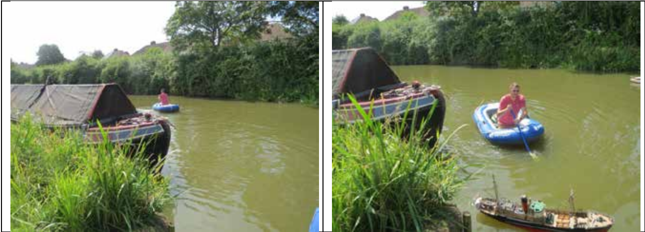
Photo's 13 & 14 Greg retrieving his Boat Using the Inflatable Dingy

Another minor disaster was that Greg Weedon managed to get his boat stuck in the reeds on the opposite side of the canal, even the club pole fully extended would not reach it. Thus the new club inflatable was put to good use after it had been inflated by Pete. Greg was delegated to use the inflatable to retrieve his stranded boat Photo's 13 & 14.