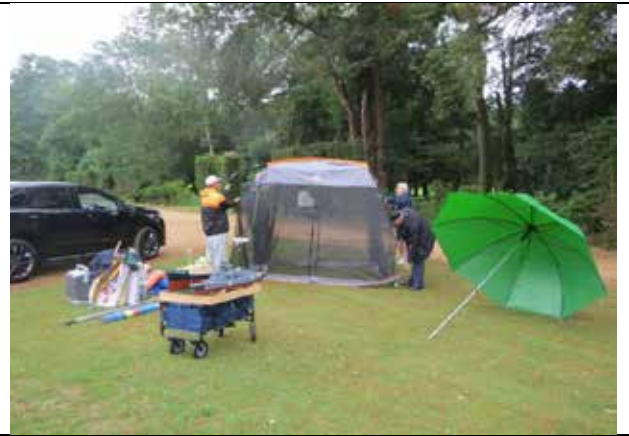
Starting to Set Up the Area