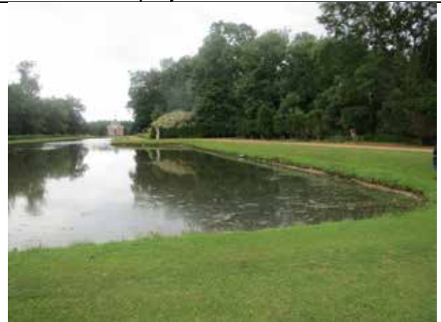
The Weed in the Lake, Causing Problems