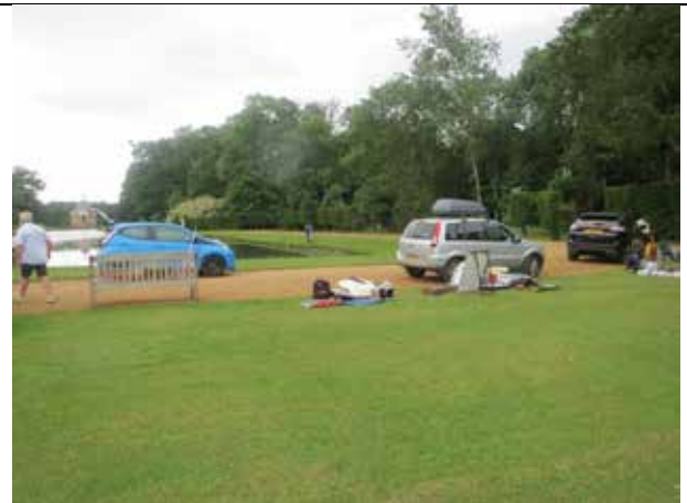
Sorting all the Bits Out for the Display