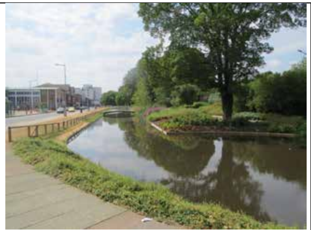
Photo 2 Our View of the River Gade