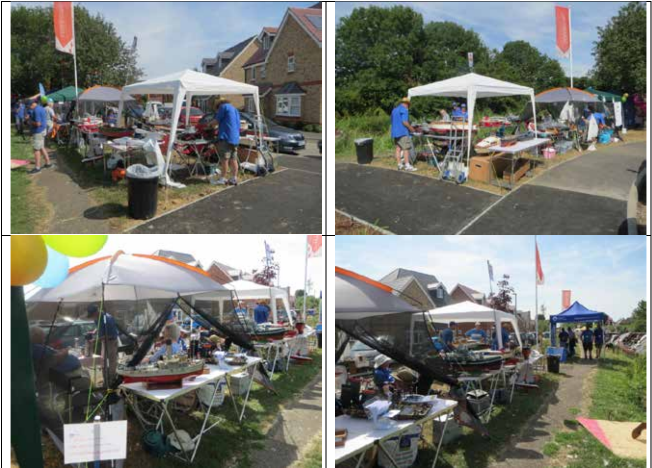
Photo's 1,2,3 & 4 Display Area Set up

We did manage to find a place to park, all be it some distance away from the Club area which we had spotted while looking for a parking space. We then joined our fellow Club members and provided some additional assistance in setting up the gazebos and tables alongside the canal towpath Photos 1, 2, 3 & 4. I then managed to re-locate my car closer to our display area which meant we did not have very far to carry all the boats.