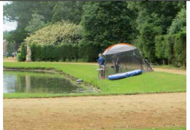
Ready with the Boats - but no Takers