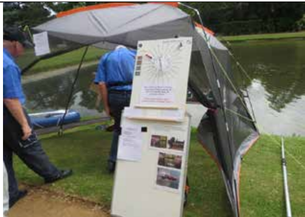
Have-a-Go Boat Tent