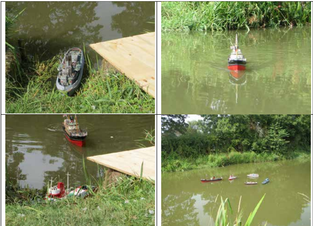
Photos 8,9,10 & 11 Boats Sailing on the Canal