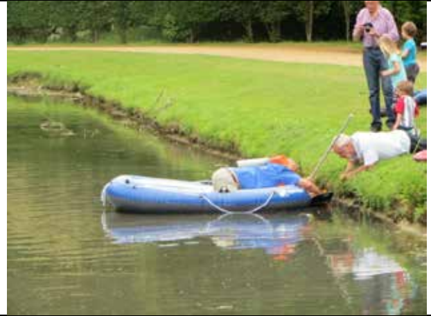
Model Boat Retrieved & Being Fixed