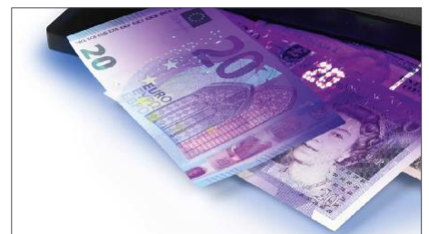
For all currencies