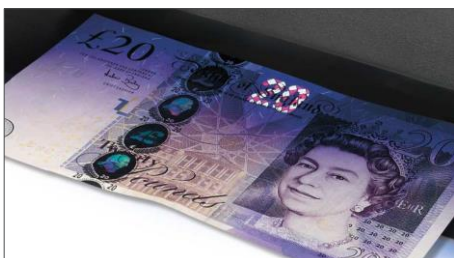
Verifies the UV features of banknotes