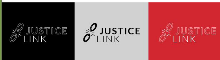
Option 2: Horizontal Logo