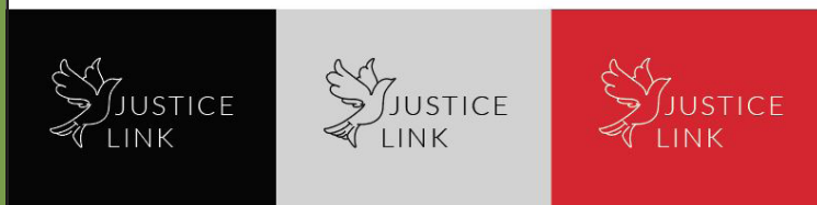
Option 1: Right Side Logo