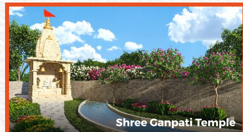
Shree Ganpati Temple