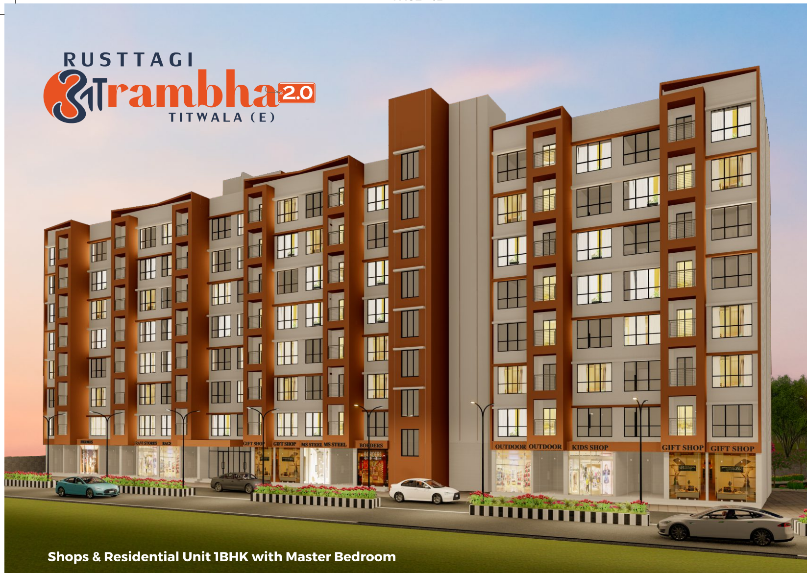
Shops &amp; Residential Unit 1BHK with Master Bedroom