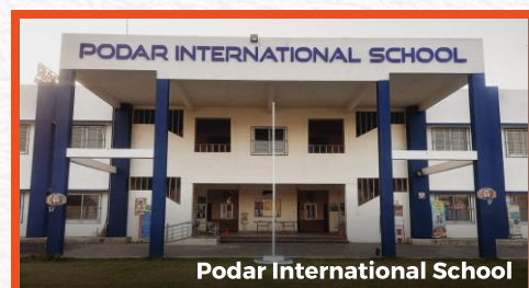
Podar International School