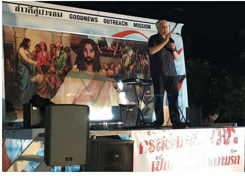
December 2, 2017 in Wang Takoo village