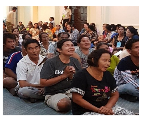
Somehit (hands folded) excited to be baptized