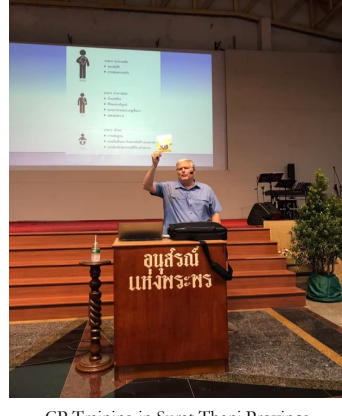
CP Training in Surat Thani Province