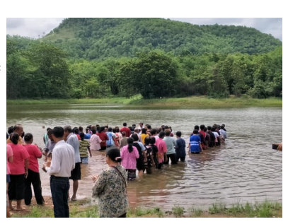
Baptism service in June