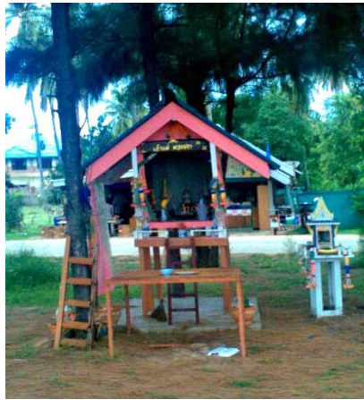
One of millions of spirit houses that dot the country

For the average Thai, Buddhism and its practices deal primarily with the questions of death and the hereafter. Animistic practices address the issues of the here and now. The result is what is called "Folk Buddhism". If Buddha could come back and discover what his followers truly believe he would be appalled because it is contradictory to his teachings.