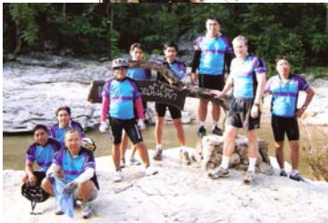
The Doi-Kom Biking Team