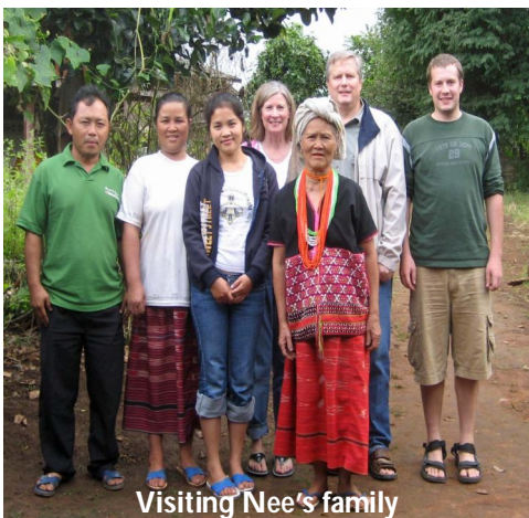
Visiting Nee's family

On a personal note - besides working at the office every day, we have been able to take a few excursions to the mountains. A few weeks ago we visited the families of three of our employees at their village, Nong Jet Nuey, high up in the mountains. We enjoyed meals with them, including a chicken head and feet. They are a very generous people, and we brought back pumpkins, rice and avocados.