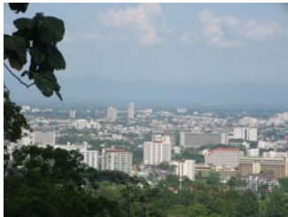
Chiang Mai, Thailand, where we will be living.

Let us bring you up-to-date on what is happening in our lives.