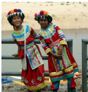
Tribal children from Northern Thailand

The purpose is to multiply the effectiveness of the church using aviation and other strategic technologies that overcome barriers in reaching the world for Christ.