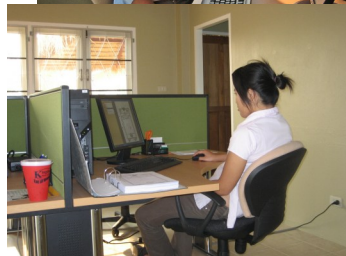
Toon & Nee at work