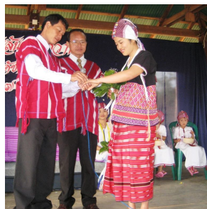
Karen Tribal Wedding

There was quite a contrast between these two weddings.