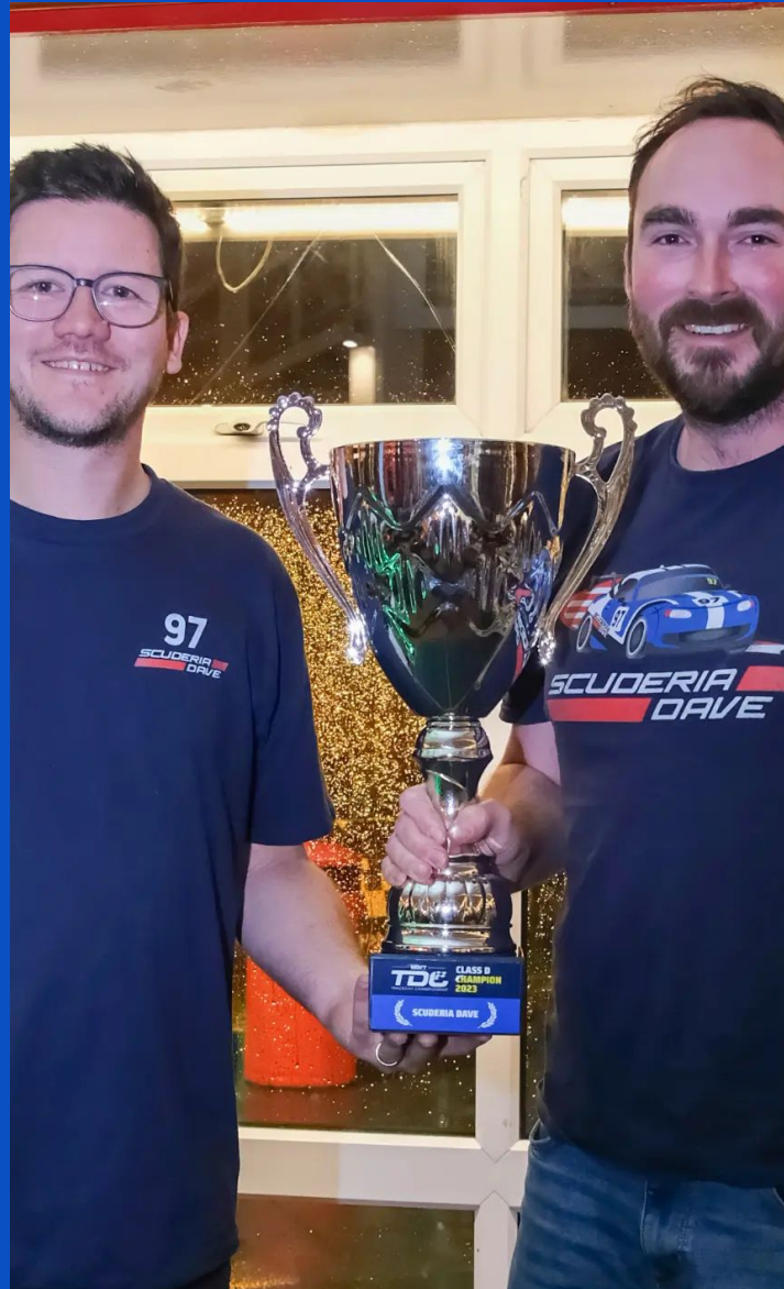
Class D Trophy