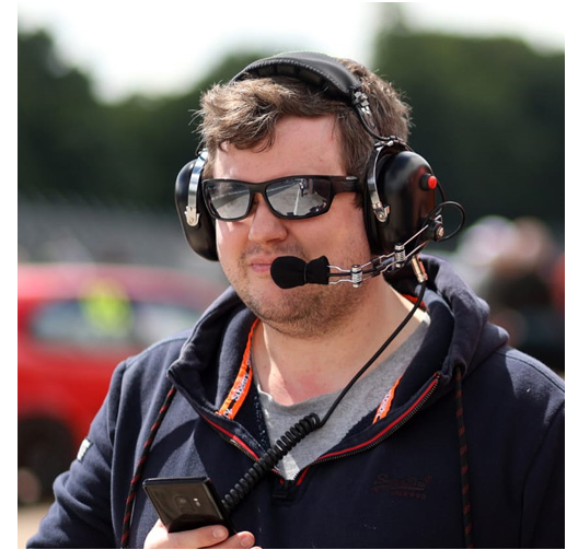
TC - Strategy