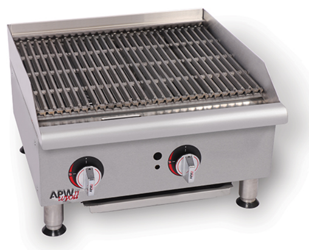
Model GCB-24i Gas Radiant CharBroiler