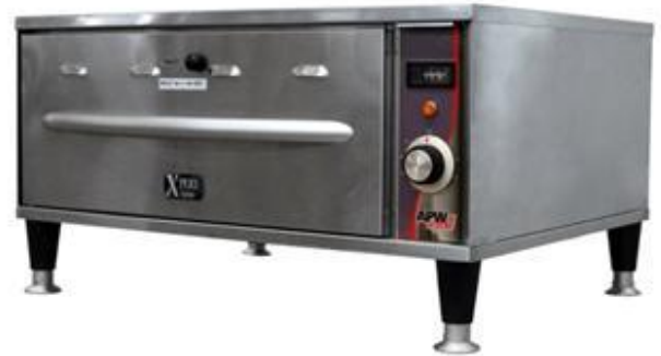
Model: HDDi-1 Countertop Holding Drawer