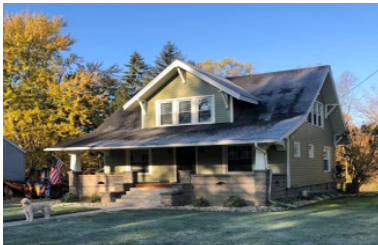
370 Sycamore St. The Atkin Home