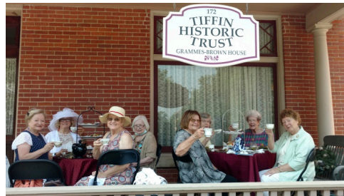
Al fresco porch dining during the August Tea