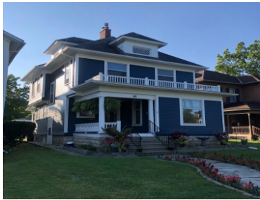
95 Sycamore St. The Focht House