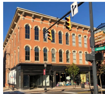
The Empire Block Lofts 140 South Washington St. 144 South Washington St.