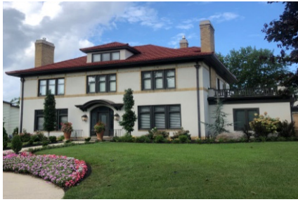
498 South Washington St. The Mack Home