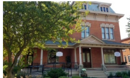
172 Jefferson St. The Grammes-Brown House Tiffin Historic Trust Headquarters

Sunday, December 5, 1:00 p.m. – 5:00 p.m.