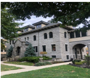
85 South Sandusky St. St. Mary Rectory