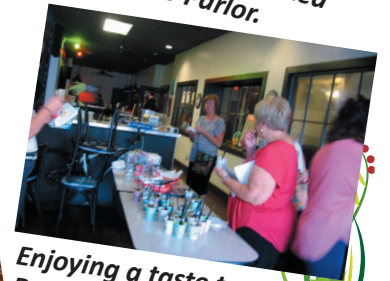
Enjoying a taste treat at Put-in-Pita