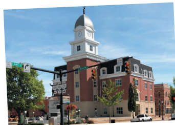
Tiffin-Seneca Justice Center