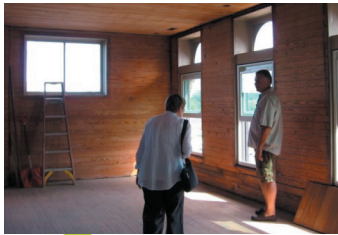
Kip Kieffer imagines the future of 33 Court St.