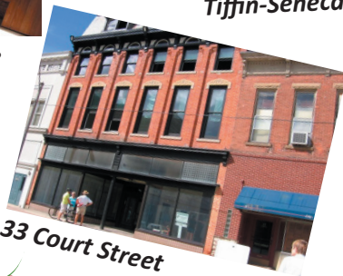
33 Court Street