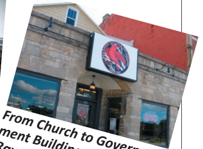
From Church to Government Building to The Red Raven Tattoo Parlor.