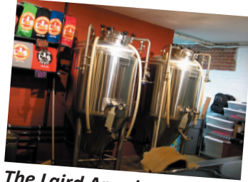
The Laird Arcade Brewery