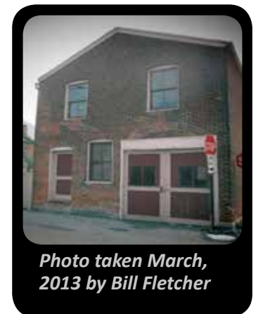
Photo taken March, 2013

And, since history is important to our group, it might be interesting to note that the building we call the Carriage House was built in 1911 as an enterprise to repair that "new rage" -- the automobile. However, at that time it was referred to as the "Tin Shop". Should we call it that now?