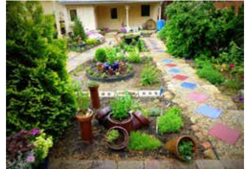
Left: The Grammes-Brown Garden Top: The Paula and Herb Crum Garden