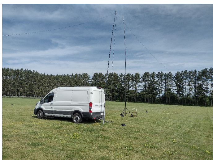
The KC9RF "POTA" Mobile and antennas. When Bob is not participating in Field Day, you can find Bob weekly along with Dave N9DBS operating POTA from various Northwoods locations. Their favorite bands are 20-meters and 40-meters.