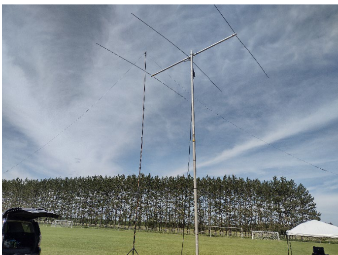
One of the several antennas used at Field Day included is a 6-meter beam and 40-meter Vee.

Thanks go out to all that participated and visited the VCARC Sugar Camp Field Day site this past weekend. Special thanks to: