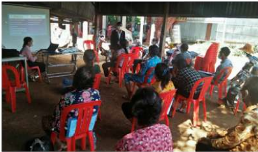
Refresher training for beneficiaries on chicken raising and self-help group saving

The project assisted 56 families in their chicken raising businesses, 51 of those were people living with HIV (PLHIV), the remaining five were orphans and vulnerable children. One of the aims of the project is to enhance PLHIV knowledge on utilizing, managing and leading the VSL to support their livelihood security and sustainable independence. In order to achieve this goal, project staff worked together closely with other civil society organizations and projects, community members, and relevant stakeholders such as the Department of Agriculture, Forestry and Fishery.