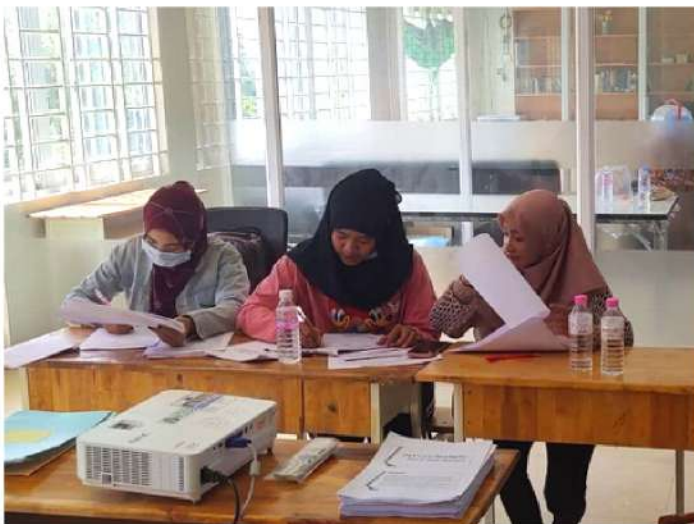
PRU training with Cham girls