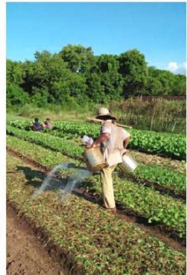
Home visits to the beneficiaries small businesses