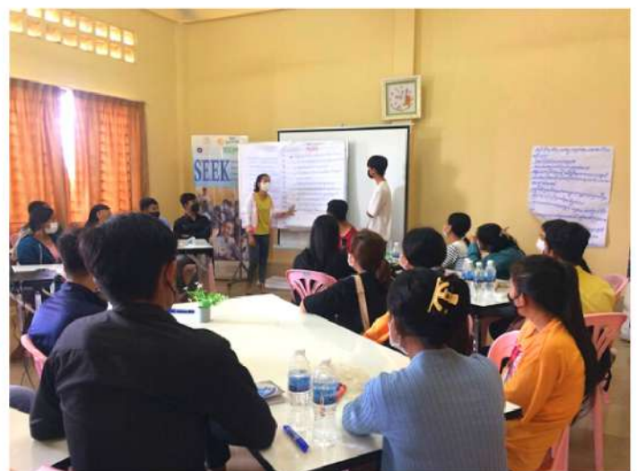
Career counselling and job matching workshop in Kampong Cham