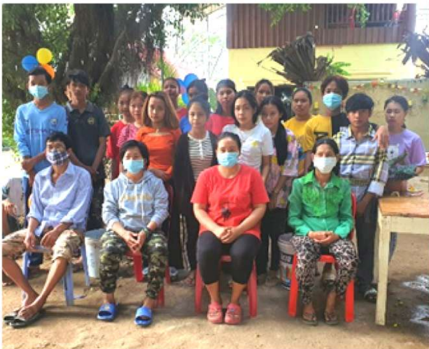
Holiday activity at Smile Institute