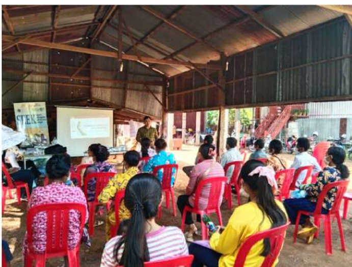
SHG SEEK workshop in Tbaung Khmum