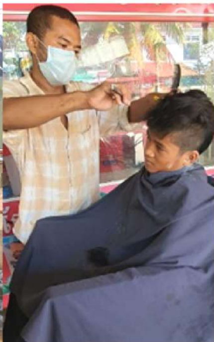
Male students are brought to see a barber monthly