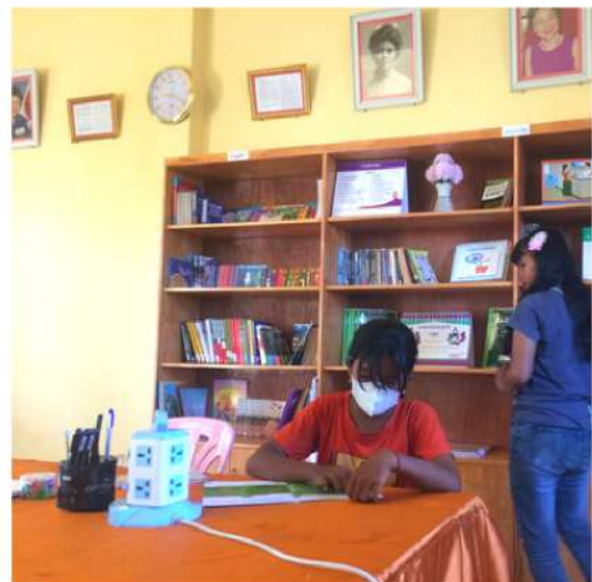
Walk-in counselling and library