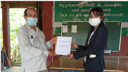
Reporting back to the community

56 families participated in trainings focusing on group leadership, VSL development, their roles and responsibilities and chicken raising updates. Participants reported having increased their knowledge and also feeling comfortable in sharing what they learned with others. Project staff followed up with VSL and CRP groups eight times during the year to check their progress and prepare them for the phase-out. Beneficiaries were educated about chicken and duck vaccinations during five different meetings. They were taught about the different vaccines and how to properly administer them as well as how to budget for the cost. Chicken Raising Project also collaborated with SEEK project to improve project implementation, giving integration plan training on CR and VSL groups to 56 beneficiaries.