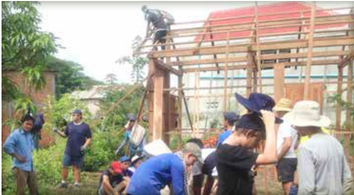
The Wat Nokor Bachey's team in action.

BSDA អង្គការ សាមគ្គីភាពសម្រាប់ការអភិវឌ្ឍន៍សង្គម Buddhism for Social Development Action