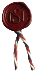
(family seal from 1960)