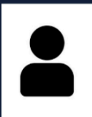
Vacant Region 3 Board Since Jan. 2025