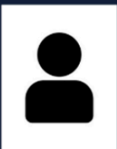
Vacant Appointed Board Since Jan. 2025

Source: https://sites.google.com/view/nadawakens/home